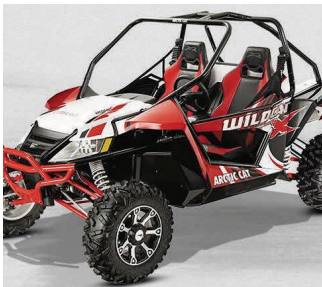
A fun ride with plenty of power!

During the 2013 CARA Pig Roast September Long Weekend Event Ralph's Motorsports was very generous to let me try out the Arctic Cat 2013 Wildcat 1000. I had a lot of fun bombing around in it but I have to say I still enjoy riding my quad which is an Arctic Cat 700 TRV. I was very exciting to have the opportunity to take the Wildcat out for a ride, not